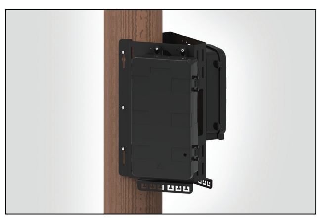
Pole Mounting Bracket with AFN and FFE.